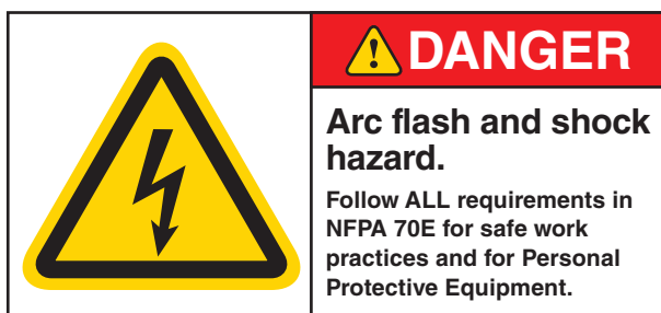
FIGURE 1-4 Typical pressure-sensitive arc flash and shock-hazard label to be affixed to electrical equipment as required by NEC 110.16 .

NEC 590.6(A) and (B) require that ground-fault circuit-interrupter protection for personnel be provided for all 125-volt, single-phase, 15-, 20-, and 30-ampere receptacle outlets irrespective of whether they are a part of the permanent wiring of the building or structure, or are supplied from a portable generator that is rated 15 kW or less. The issue is whether these power sources supply receptacle outlets that are in use by the worker. An exception is provided for receptacle outlets of other ratings that have protection by the testing protocols of an assured equipment grounding conductor-testing program.