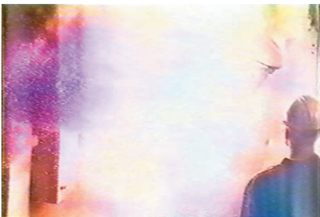
FIGURE 1-1 Arc flash and arc-blast event.

A series of tests were performed to determine the temperatures and pressures an arc flash and blast event would produce. The results of test No. 4 are shown in Figure 1-2. For this test, the voltage was 480, with approximately 22,600 amperes short-circuit current available. The over-current device on the supply side of the fault was an electronic power circuit breaker set to open in 12 cycles.